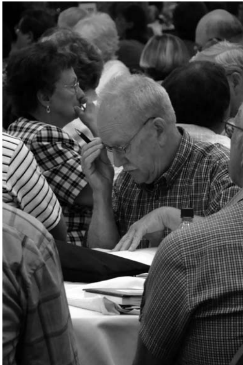
Annual Conference 2007

*Statistics are from the Kentucky State Data Center, Louisville, KY.