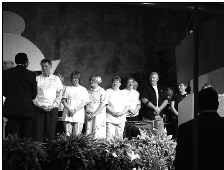
Thank You to 2006 Kentucky Annual Conference Volunteers

*Statistics are from the Kentucky State Data Center, Louisville, KY.